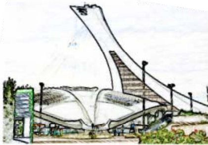
Montreal Olympic Park

Through the Rendez-Vous Canada (RVC) Tour Programs we have had the opportunity to work with various Canadian Parents for French chapters across the country, providing engaging, entertaining and cost effective tours of Quebec City and Montreal. Discounts are available to CPF members who choose to travel with the RVC program.